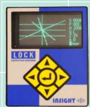
DDS (Direct Digital Signal)